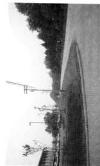
5 FROM INNOVATION DR. LOOKING EAST ON TO DUTCHTOWNE ROAD N.T.S.