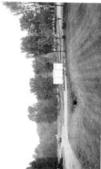
7 SIEMENS SIGN (PROPERTY TO NORTH) N.T.S.