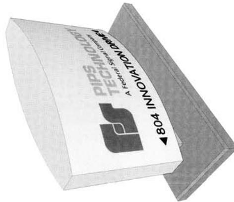
3 PERSPECTIVE N.T.S.