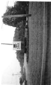
8 MERIT SIGN (PROPERTY TO WEST) N.T.S.