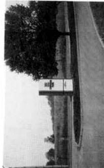
6 CORRIDOR PARK SIGN N.T.S.