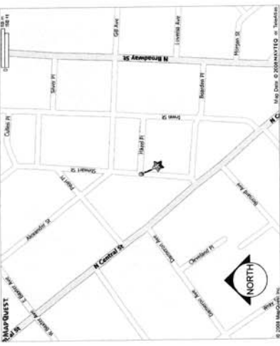
1 LOCATION PLAN