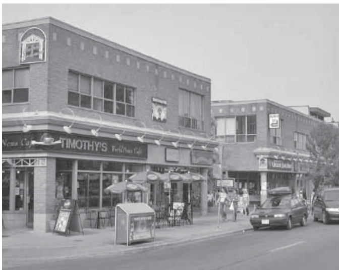
Buildings should usually have from two to four stories

The buildings should usually have two to four stories. One-story buildings should be avoided, as should buildings higher than four stories, particularly when such buildings are adjacent to low-density residential areas.