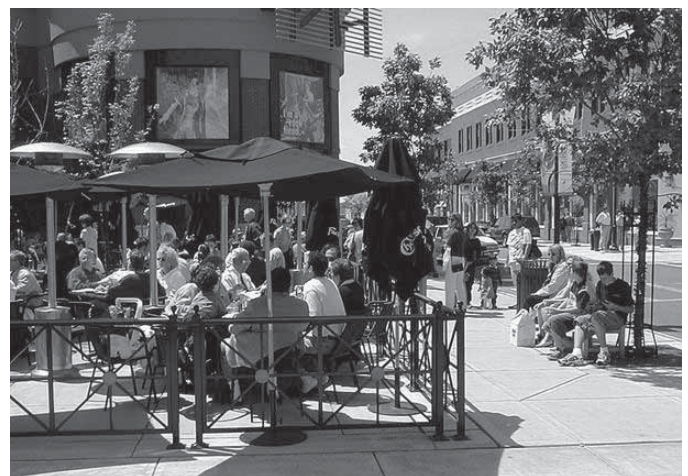
Setbacks are allowed if they are used to create a pedestrian-friendly activity, such as outdoor seating.

Several types of “build-to” lines should be established for development in the district. Buildings with retail uses on the ground floor should have little or no setback, unless a setback is required for outdoor seating or a display area, or eventual sidewalk widening.