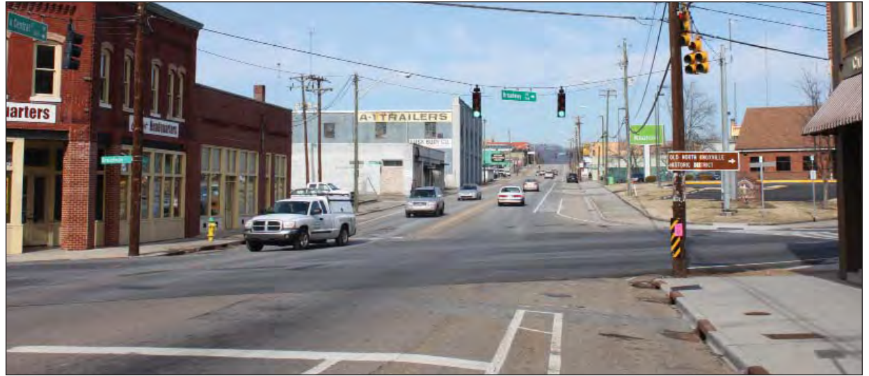
Broadway and North Central Street could be transformed with the reuse/renovation of existing structures and complimentary infill development.

Form District or Corridor Overlay District zoning should be developed for the area. Basic and Planned Development district zones that allow a “recommended use”, or mix of these uses, for this district can be considered and should be conditioned with the applicable “Development characteristics” of Appendix 3 (Mixed-Use Development Guidelines) in the Broadway-Central-Emory Place Small Area Plan . The development characteristics include guidelines for building setbacks and height, commercial building design, parking, driveway access, open space, and lighting.