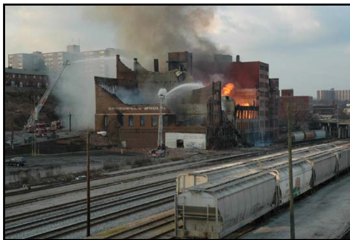
McClung Warehouses during the February 2014 fire.