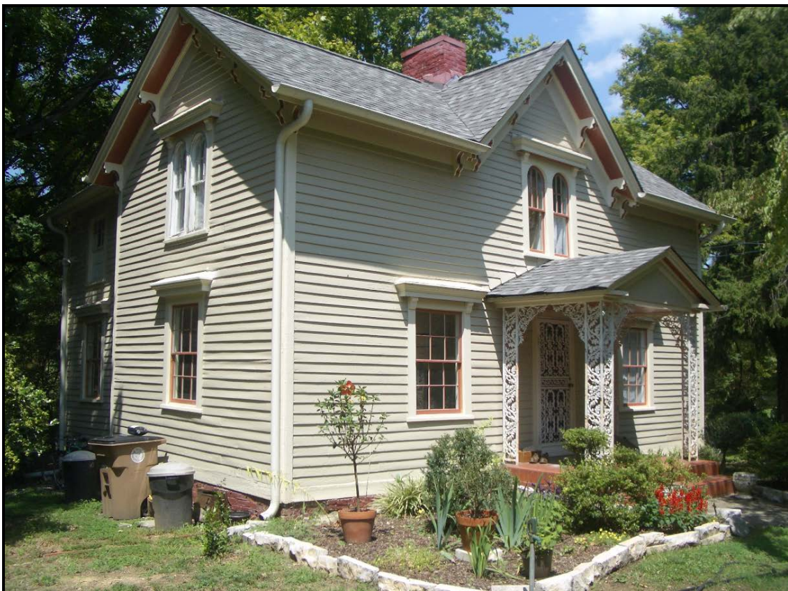
The Winstead Cottage (a.k.a. Winstead Mansion)

The Winstead Cottage (c. 1886) is significant as a unique local example of an architectural style, Italianate with Gothic Revival influences, of which very few examples still exist in Knoxville. Confederate Cemetery (1881) is significant for its place in local societal history during the period of Knoxville's involvement in the Civil War, and as representative of the subsequent Southern regional efforts of Ladies' Memorial Associations to commemorate Confederate dead. The Confederate Monument (1861) is significant as a notable design by local artist Lloyd Branson, who is otherwise known for painting and portraiture. A National Register nomination was completed for these structures by the Hazen Museum Board of Directors toward the latter part of 2014. An official designation is expected in spring of 2015.