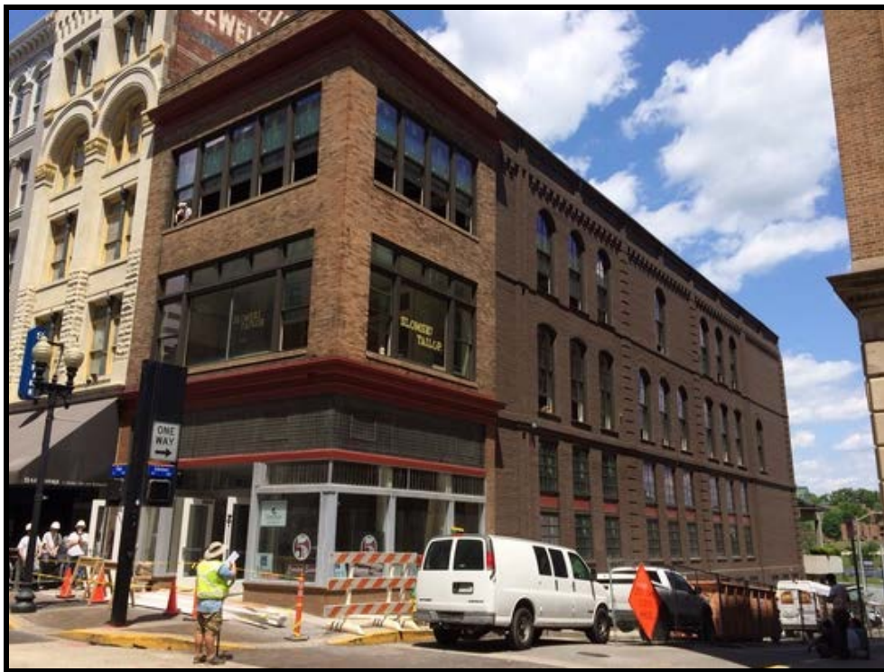
The Slomski Tailor Building during renovation.

The former “Arby’s” building, now known as Tailor Lofts located at Gay Street and Union Avenue reopened in May 2014 to include nine residential units and a street-level restaurant. The building was constructed c. 1876 and is one of the oldest on Gay Street. The building survived a fire that took out many of the surrounding buildings during its early years. The newly renovated building was renamed Tailor Lofts since the Slomski Tailor business occupied a portion of the building during the mid-20 th century.