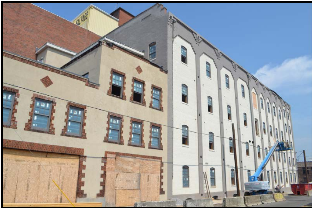
View of the White Lily Building from the N. Central Street side- façade restoration in progress

The White Lily Flour manufacturing plant opened in January 2014 after it was renovated for adaptive reuse as a 46-unit residential apartment building. The main building retains its industrial character, and displays elaborate corbelled brickwork along the roof cornice. It was constructed in 1885 by James Allen Smith. Besides the primary production of a variety of flours, the company also manufactured shipping barrels. White Lily flour was produced in the building until 2008. “White Lily Flats,” as it is now known, will help to further the edges of downtown’s Old City area to the north.