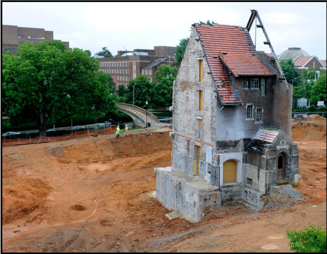
Remains of UT’s Sophronia Strong Hall

In January 2014, the Sophronia Strong Hall building on the University of Tennessee’s campus was demolished except for a small portion for a science classroom and laboratory facility. The remaining 20,000 square-foot portion with its steeply-pitched roof and distinctive entryway arch will be incorporated into a nine-story 268,000-square-foot building. Constructed in 1925, the hall served as a residence hall for women until 2008. The stone wall and footbridge spanning Cumberland Avenue in front of the building has been retained. A small Queen Anne-style gardener’s cottage on the north corner of the site will be retained and restored.