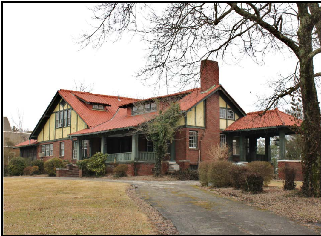
The Christenberry House at 3222 Kingston Pike is threatened by future development.

A demolition permit was approved in December 2013 since the house is not protected by a historic zoning overlay. However, more recently potential developers have expressed interested in renovating the house for offices, and building residential units to the rear of the house. The Sequoyah Hills Homeowners' Association has registered their opposition to the re-development as multi-family due to concerns which include increased traffic congestion and the change from single-family character.