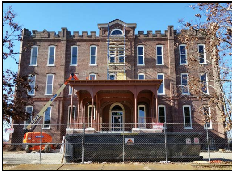
Lakeshore Administration Building during renovation