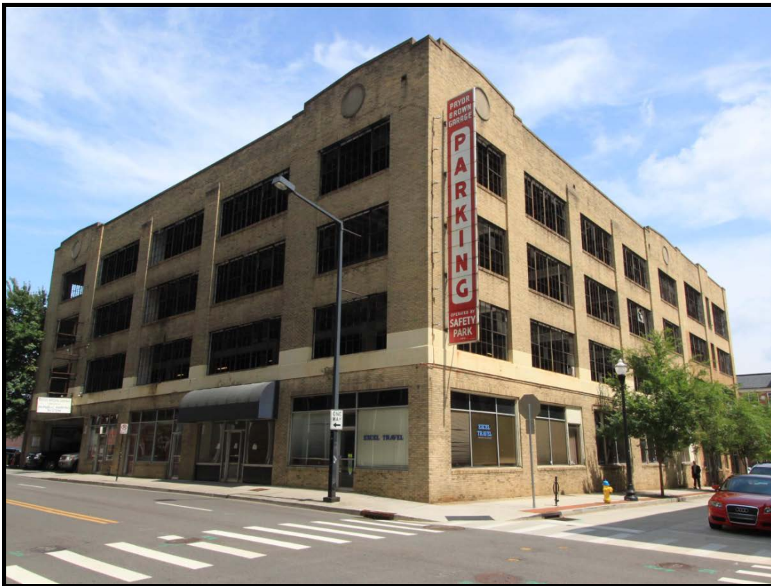
The Pryor-Brown parking garage viewed from the corner of Market Street and Church Avenue

Also in 2013, the MPC and City Council denied the owners' use-on-review request for the site's post-demolition use as a surface parking lot. He owner filed a lawsuit; however, in September 2014, there were potentially viable offers from developers who are interested in purchasing the site for re-development including adaptive re-use of the garage. The parking garage was constructed in 1925 and is one of the oldest in the country. It is eligible to be included within a National Register Historic District.