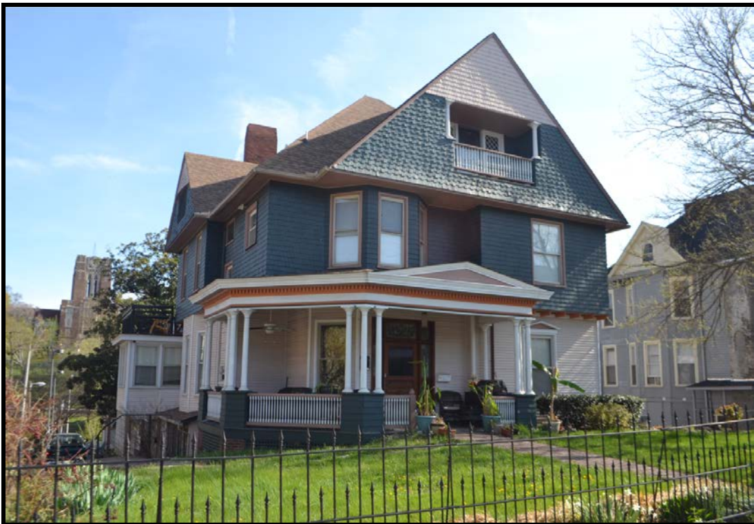
1302 White Avenue in Fort Sanders Neighborhood Conservation District

In the 2001 Master Plan for the long-term development of the UT campus had anticipated no encroachment into the Fort Sanders residential neighborhood. However, in UT's 2011 Master Plan, the subject properties were identified as being within a potential campus expansion area. Although the houses are within the Neighborhood Conservation Overlay (NC-1), they are not subject to the local zoning that would prevent demolition since they are now owned by UT which is a state entity. Knox Heritage has stated that the only strategy left to preserve the houses at this stage is to relocate them.