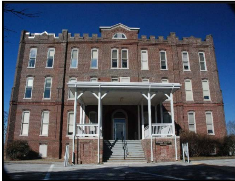
Lakeshore Administration Building before renovation

The Public Building Authority is completing a renovation of the former Lakeshore Mental Health Institute Administration Building, a $1.1 million project that includes more than 14,000 square feet of office space to be utilized by the City’s Parks and Recreation Department. Demolition of nine other buildings on the campus began in July 2014. The building was constructed in 1884 and the institute operated from 1886 to 2012. The front porch has been restored a closely as possible to the original design.