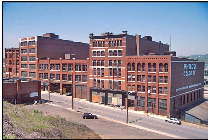
McClung Warehouses prior to a 2007 fire.

In November 2013, the City purchased, through an agreement with the bankruptcy trustee for the property, the last remaining McClung Warehouse structures located at 517 to 525 W. Jackson Avenue. On February 1, 2014 these structures (dating to 1911 and 1927) were destroyed by fire, the same fate suffered by three other W. Jackson Avenue McClung warehouses which burned in 2007. An assessment by a structural engineering firm following the 2014 fire recommended that the remaining remnants of the McClung structures be demolished for public safety reasons. The city had purchased the warehouses in 2013 with the hope of finding a buyer to redevelop them. The vacant sites will still be redeveloped following a public input process and the issuance of a request for proposals.