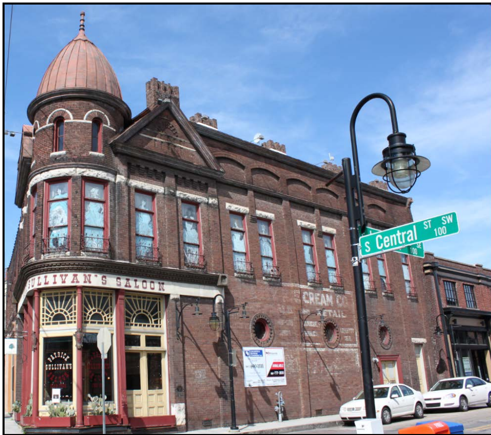
Patrick Sullivan’s Saloon prior to renovation as viewed from S. Central Street.

The vacant corner building that once housed Sullivan's Saloon was purchased by a local developer in early 2013 and has been significantly renovated on the exterior. Interior renovation work has continued into 2015 to recreate a restaurant and pub. A small, non-descript one-story addition that housed a favorite local pub along the Central Avenue side was demolished to make way for an outdoor courtyard. The 1888 Old City landmark is a two-story Romanesque Revival/Queen Anne building constructed by Irish immigrant Patrick Sullivan. The building housed a saloon until 1907, when it was forced to close due to citywide Prohibition.