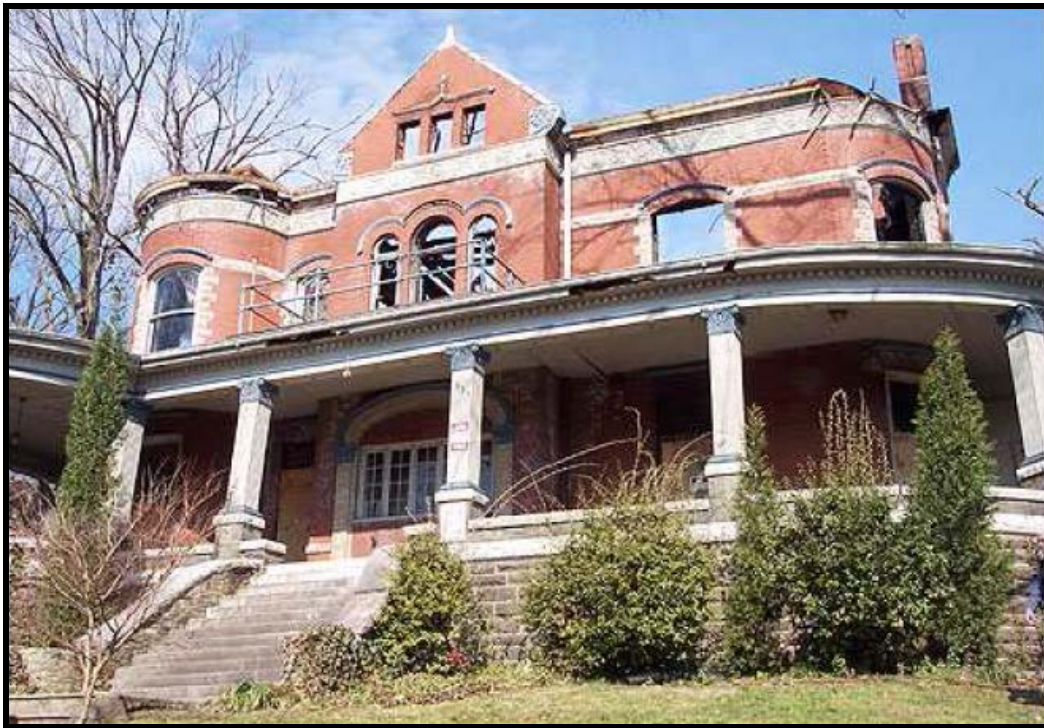
Pickle Mansion-- complicated financing as well as restoration challenges remain.