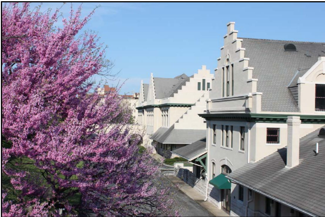
Southern Railway Terminal as viewed from Gay Street viaduct.

The station was originally constructed during 1903 and 1904 for the Southern Railway Company and was designed by Frank Pierce Milburn, architect. The building was listed as a contributing resource to the Southern Terminal and Warehouse National Register Historic District in 1985. The last regularly scheduled passenger train left the terminal in 1970.