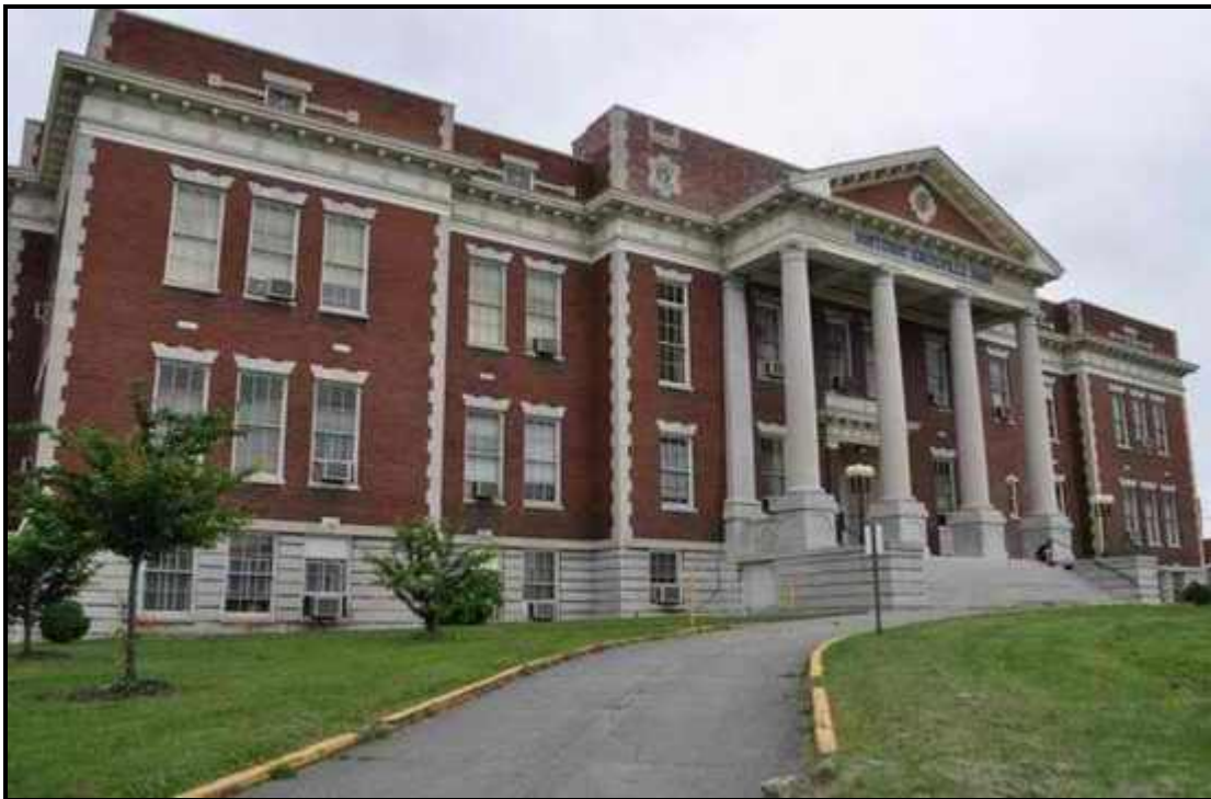
Historic Knoxville High School

Following a County request for proposals, the sale of the county-surplused Knoxville High School building was finalized October 20, 2014 to Family Pride Corporation. The corporation plans to convert Old Knox High into a senior living facility offering 75 units. The renovation is anticipated to begin sometime in 2015 and be completed in 2016. The developers plan to work toward attaining a level of LEED environmental certification while preserving the original character as much as possible. There are plans to include a museum to commemorate the former high school, as well as artists' studios within converted attic space. The school's "Doughboy" statue, which was erected in 1922 in honor of World War I veterans, is to be the focal point of a public park on the property. The building served as Knoxville High School from 1910 to 1951, and is listed on the National Register of Historic Places. It is also protected by a local zoning H-1 Overlay.