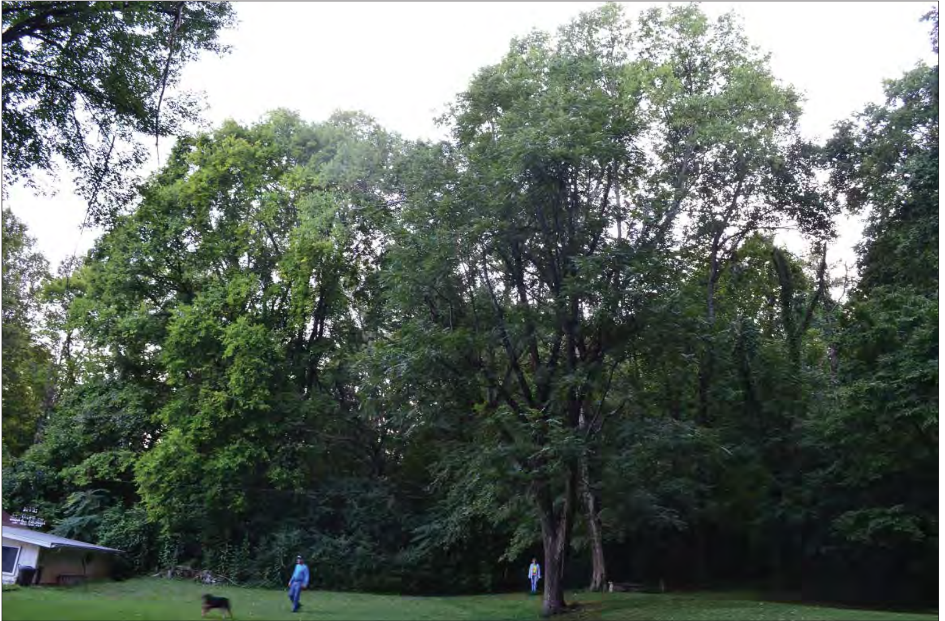
2119 Ridgecrest photo taken southeast of site