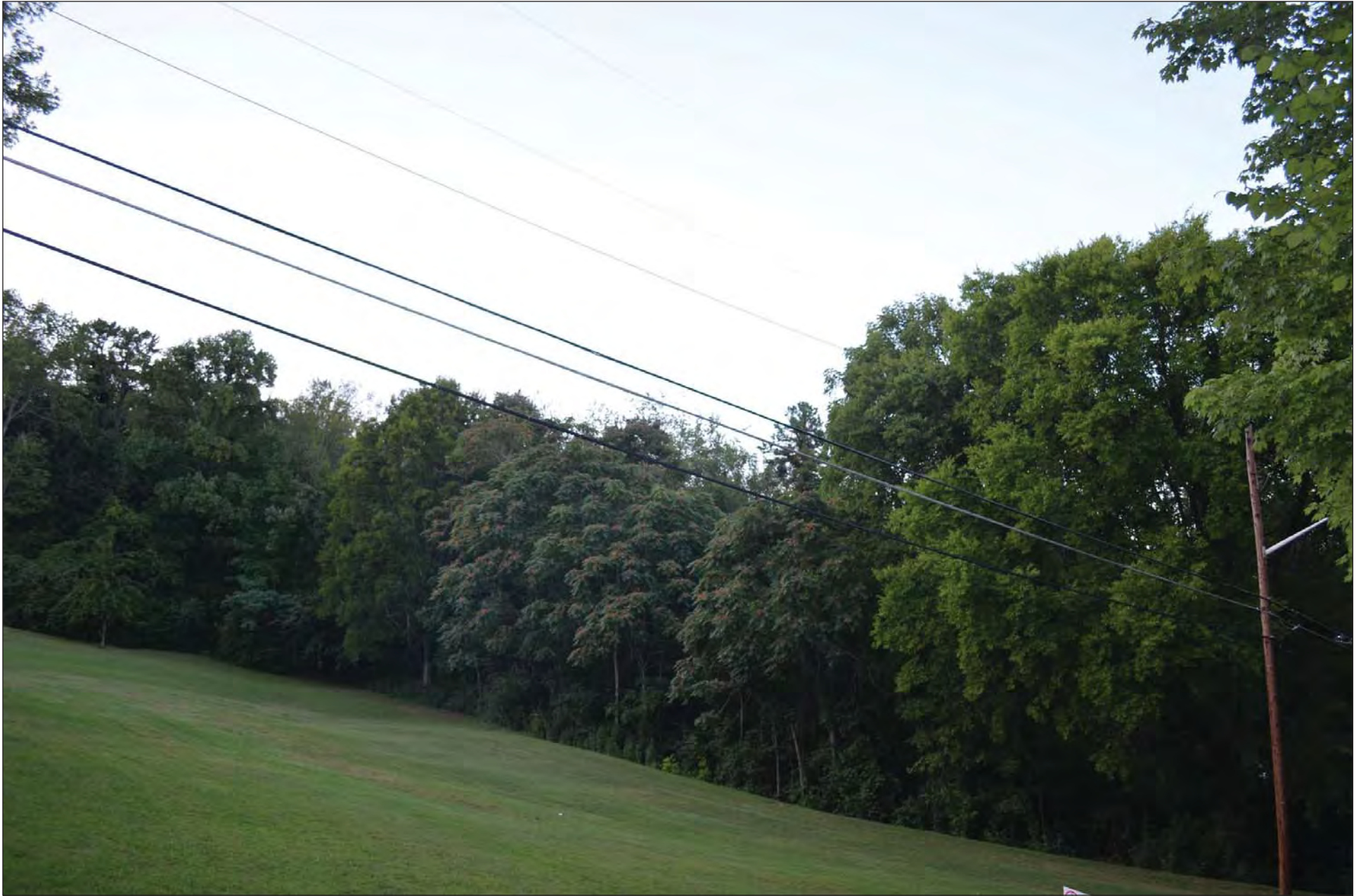
Ridgecrest southwest of site