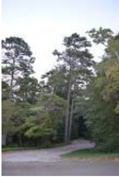
Martha Berry 2 view of site.JPG 4201K