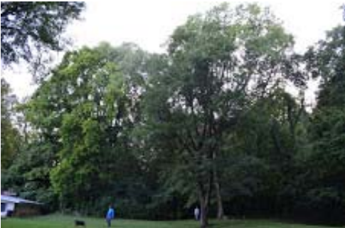
2119 Ridgecrest photo taken southeast of site.JPG 4102K