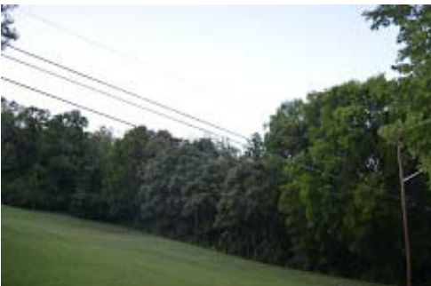
Ridgecrest southwest of site.JPG 4026K