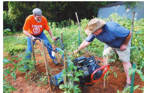
Community Action Committee GreenThumb

Regulations: A community garden represents the gardening interests of multiple non-family members. This allows for garden clubs, non-profits, or other community organizations to establish gardens for their membership. A community garden is space shared by multiple individuals or groups of individuals