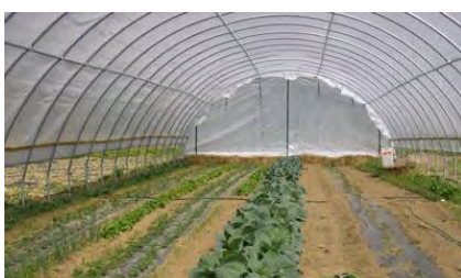
Example of high tunnels

Regulations: Bees are integral to pollination, plant health, and vegetable and fruit production industries. The right to keep bees is protected by the Tennessee State Apiary Act of 1995. While bees pose little risk to the general population, the Office of Sustainability is sensitive to those with bee allergies and the dangers of general proximity to beehives. In crafting the language about apiaries within the City, the Office of Sustainability referred to best practices from cities that had addressed urban beekeeping in zoning ordinances and consulted with the University of Tennessee extension agents.