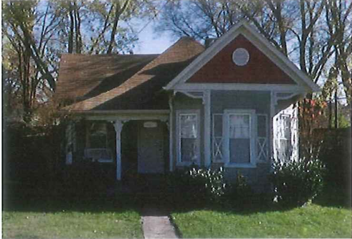
existing properties in the 400 block of E. Springdale Ave