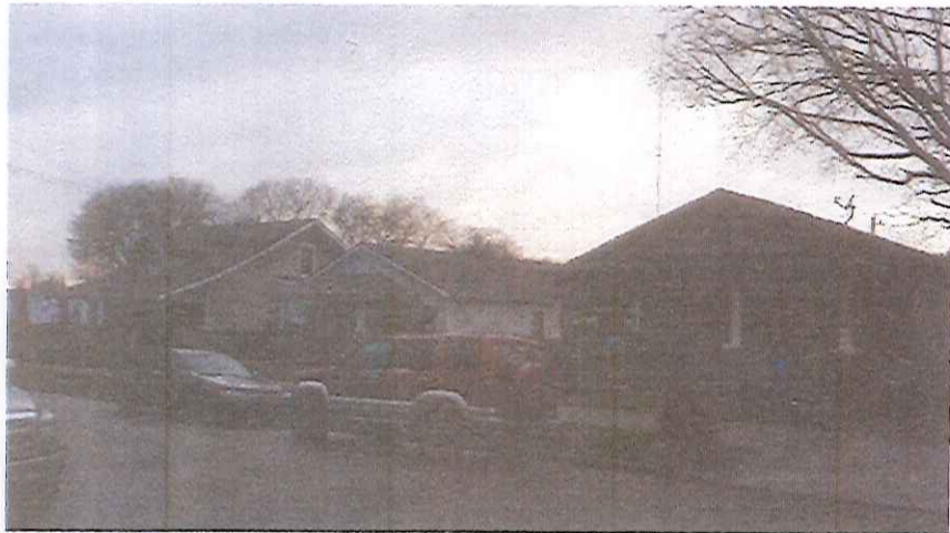
3 Infill house (circa 2013) lacking mass and scale at 207 E Burwell Ave. The middle house is Infill.