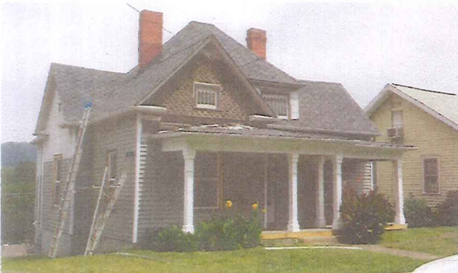
7 Victorian Rehab on East Columbia, note the exterior wall height on this house, as well as wall height of Craftsman on the right. The shake on the front gable makes it stand out.