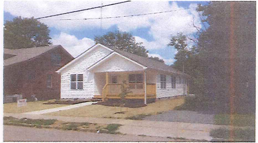
6 Infill house, Morelia Ave (2016). This has an elevated porch with steps, the ADA access is from back with parking. The prairie windows should be one over one or three over one for a craftsman, but it has a 1/2 light front door. This also lacks scale from top of windows to roofline