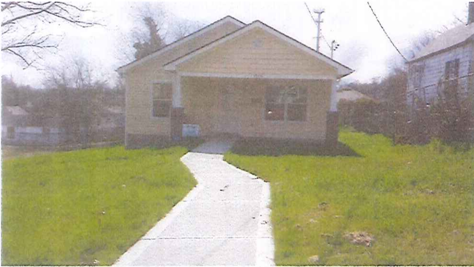
5 Infill house, Branner Street (2016). Note lack of height between top of window and roof line and lack of elevation for porch. Columns are undersized