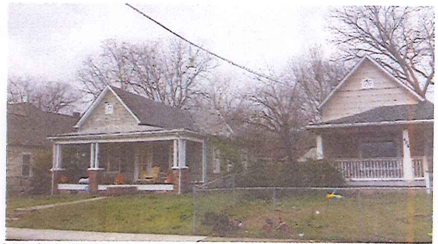
2 Original Folk Victorians on Burwell Ave, note exterior wall height, steps to elevated porch. The window on the house to the right has been replaced with a modern window, these might be a more appropriate substitute for a Queen Anne Victorian