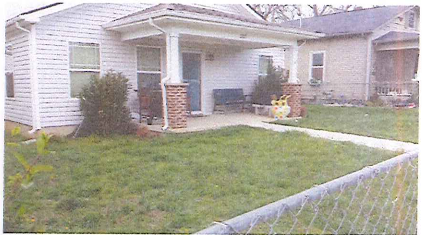
4 Same house at 207 E Burwell Ave, prairie style windows not period specific, no step up to porch, note extended wall height on original house in background