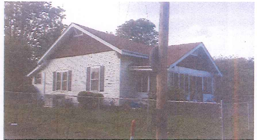
8 Original Craftsman in Oakwood, note the exterior wall height. Infill Design guidelines also regulate the use of front porch areas for living space which effects the façade of the houses seen from the street. Roof pitch tends to be lower and longer on Craftsman houses