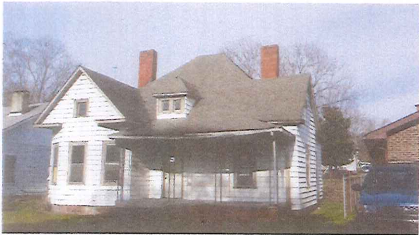
1 Original house at 431 East Springdale. Note complex 12 over 12 roofline and gables. Note height above windows to roof line. The brick house to the right stands where another original Victorian was lost in the 1970s