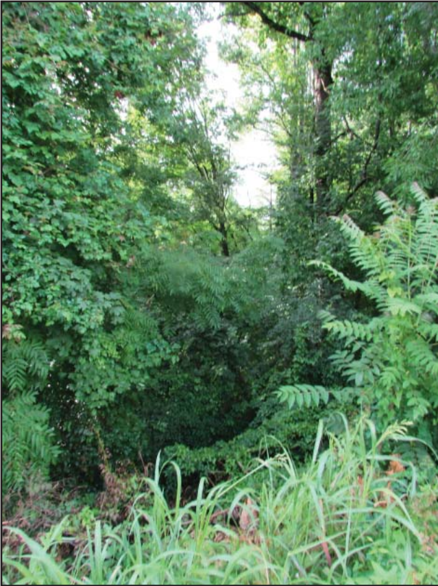
5-E-17-UR DROP OFF