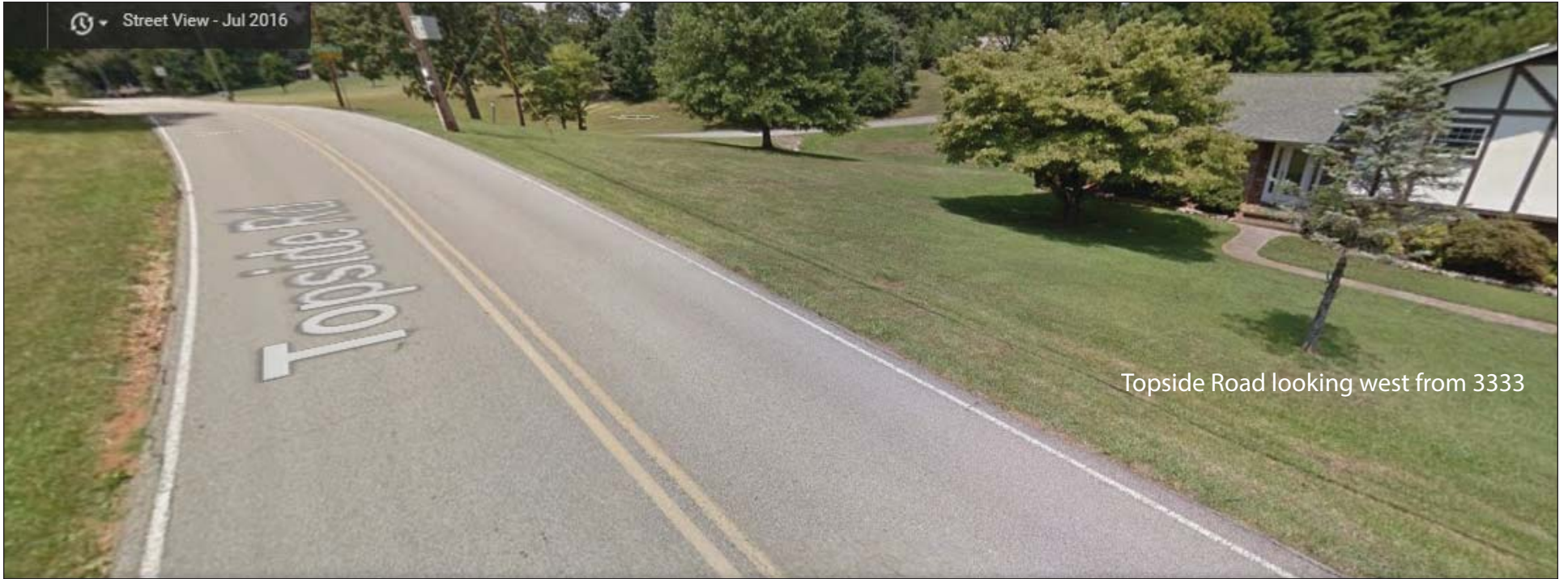
Topside Road looking west from 3333