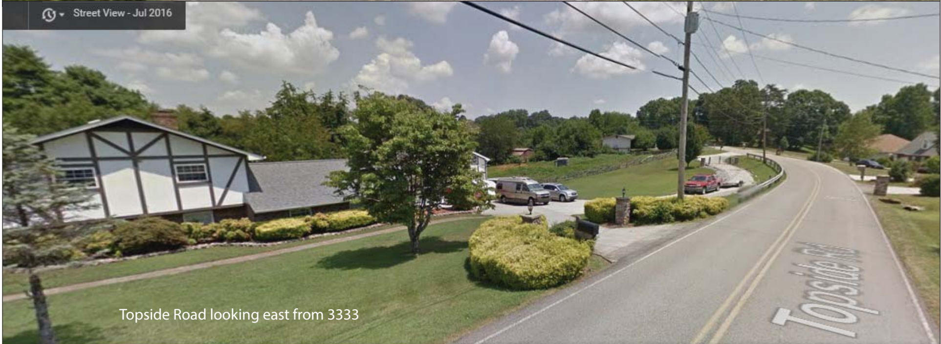
Topside Road looking east from 3333