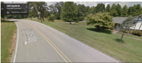
5-10-2017 Topside Road looking west from 3333.jpg 200K