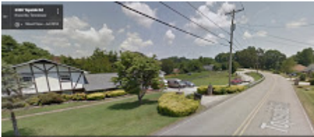
5-10-2017 Topside Road looking east from 3333.jpg 165K