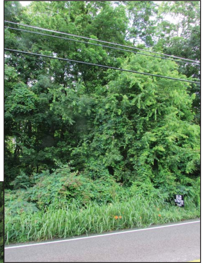
5-E-17-UR OLD ROAD