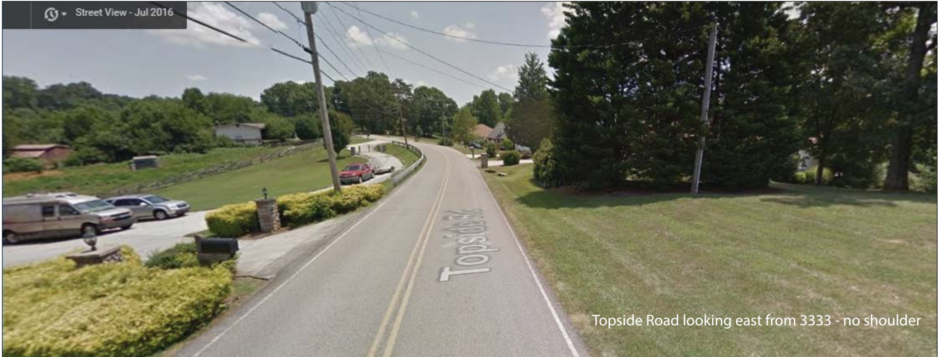
Topside Road looking east from 3333 - no shoulder