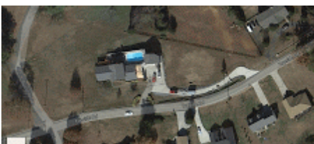
Google Front done in 2014.gif 497K