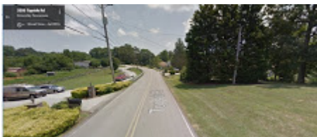
5-10-2017 Topside Road looking East - 3333 no shoulder.jpg 198K