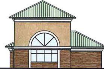
○ SIDE ELEVATION 1/8" = 1'-0"

SECURITY CENTRAL STORAGE KNOX COUNTY KNOXVILLE, TENNESSEE