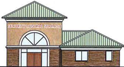
○ FRONT ELEVATION 1/8" = 1'-0"

4625 NEWCOMBLAY, KNOXVILLE, TN 37919 805-584-1899