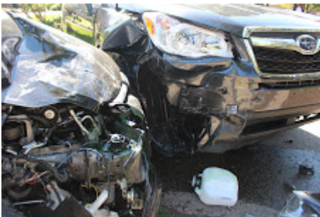
Broome Road Accident 10-3-17.JPG 7897K