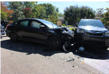
Broome Road Accident 10-3-17 II .JPG 9413K