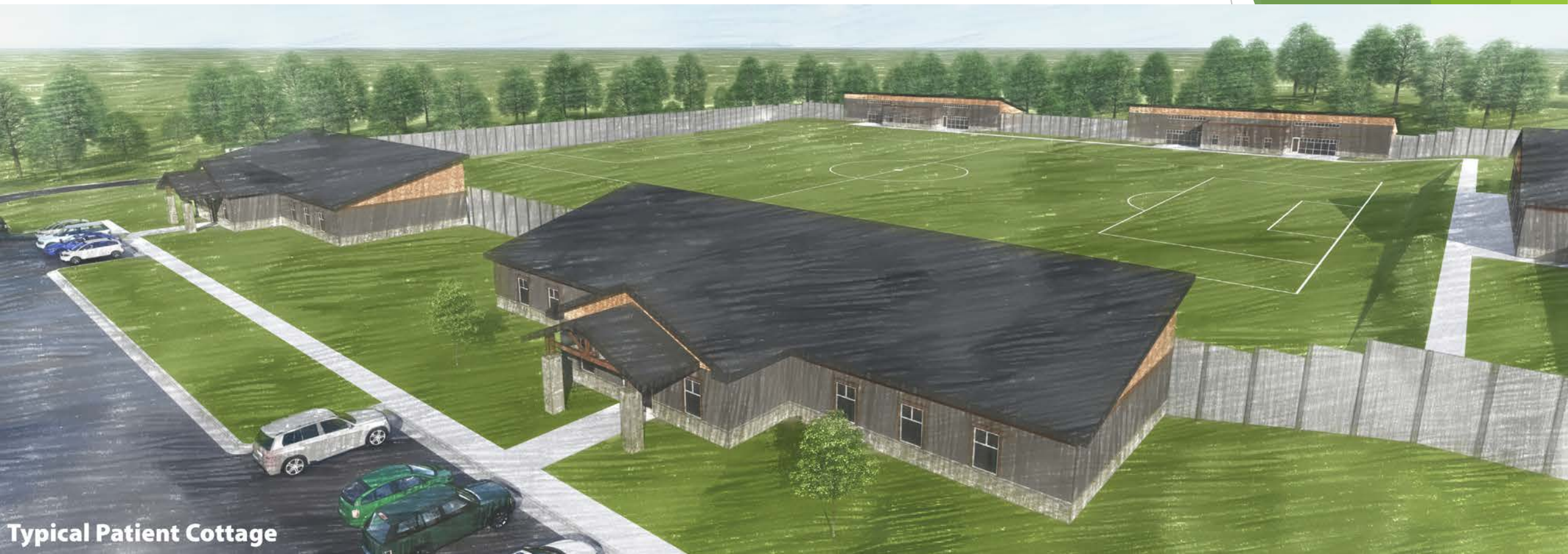
Typical Patient Cottage