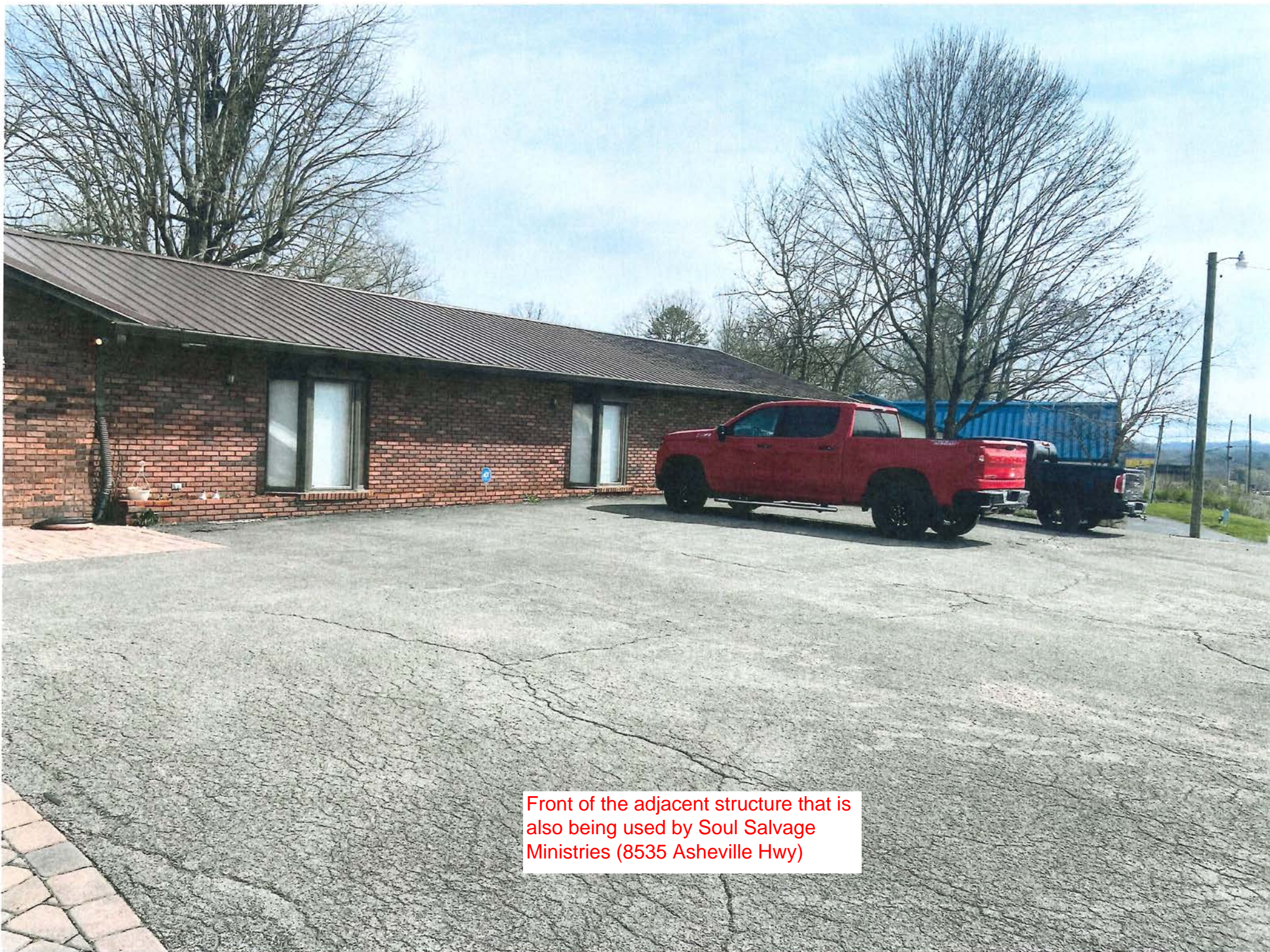
Front of the adjacent structure that is also being used by Soul Salvage Ministries (8535 Asheville Hwy)