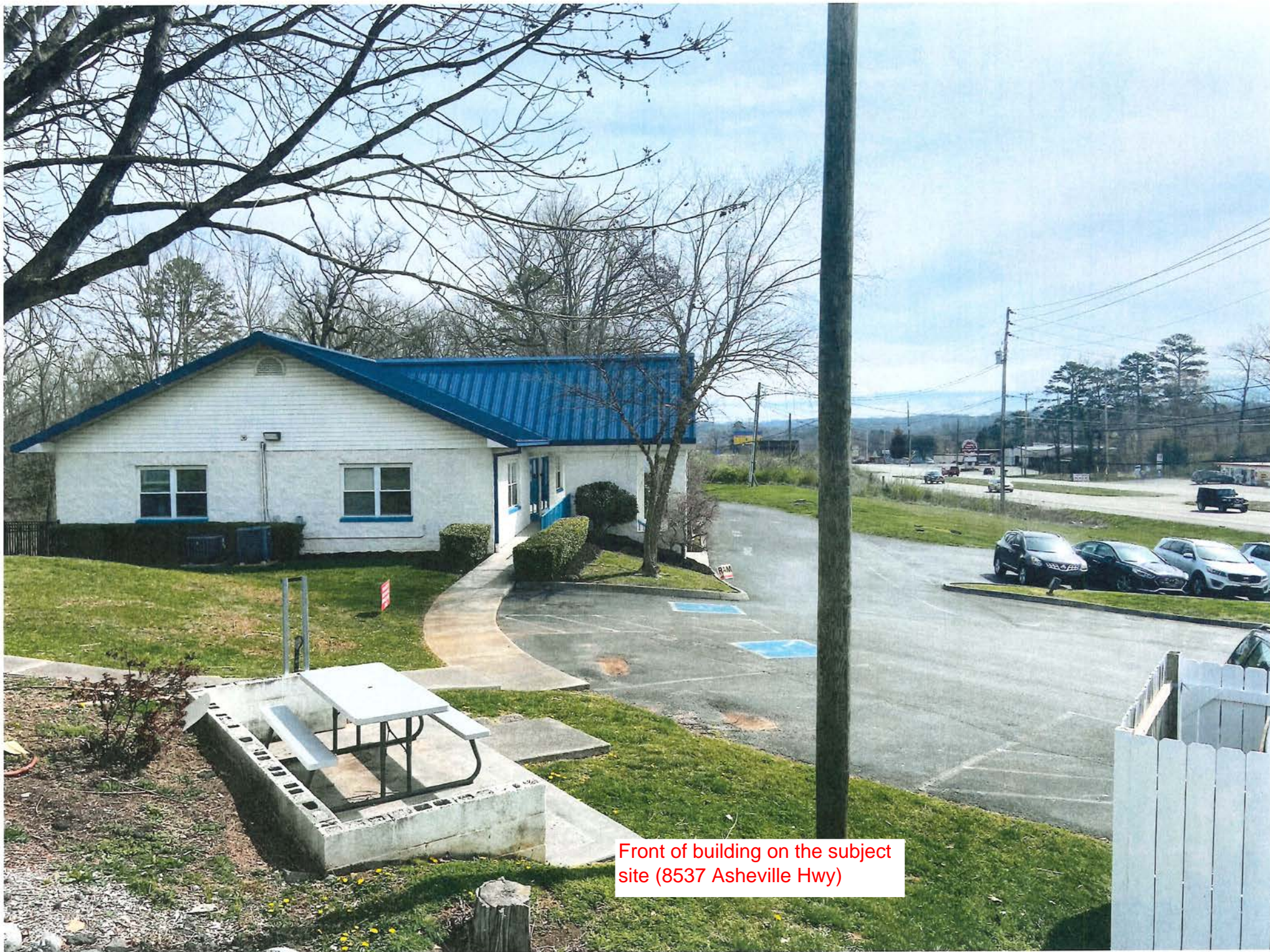
Front of building on the subject site (8537 Asheville Hwy)