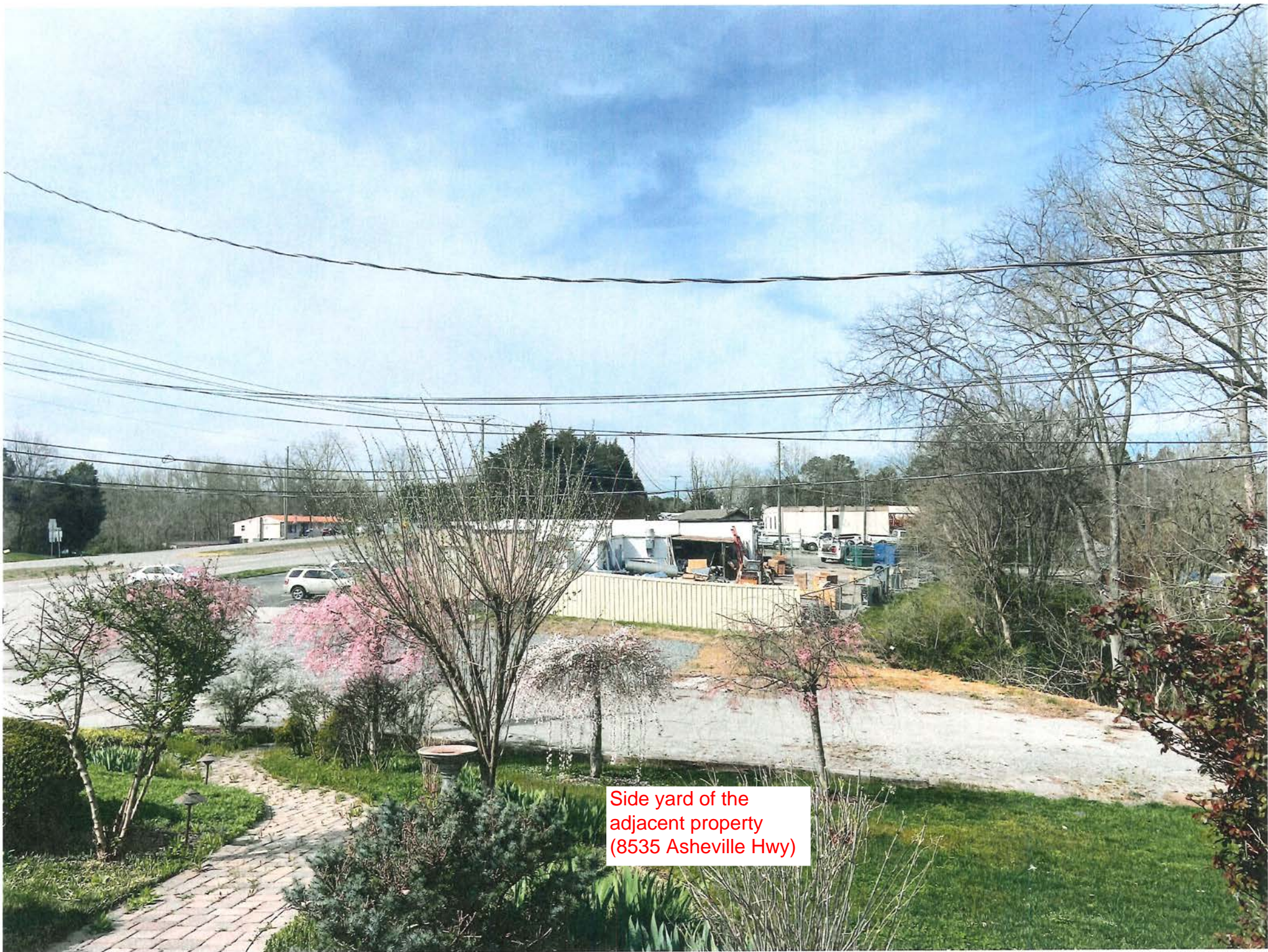
Side yard of the adjacent property (8535 Asheville Hwy)