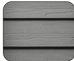
HARDIE PLANK SIDING MATERIAL OPTION

NOTE: FINAL MATERIAL SELECTION FOR SCHAAD ROAD LOCATION TO BE DETERMINED