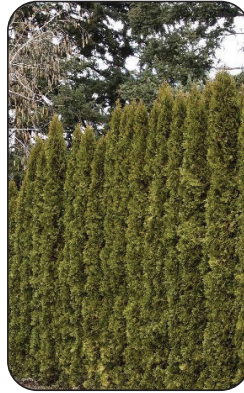
Emerald Green Arborvitae Thuja occidentalis 'Smaragd'

Mature Size: 25' - 30' tall, 8' -10' wide