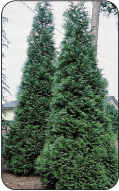
Green Giant Arborvitae Thuja (standish x plicata) 'Green Giant'