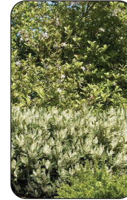
Otto Luyken English Laurel Prunus laurocerasus 'Otto Luyken'