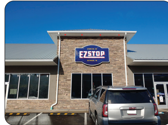
STORE FRONT EXAMPLE SEYMOUR, TN

NOTE: FINAL MATERIAL SELECTION FOR SCHAAD ROAD LOCATION TO BE DETERMINED