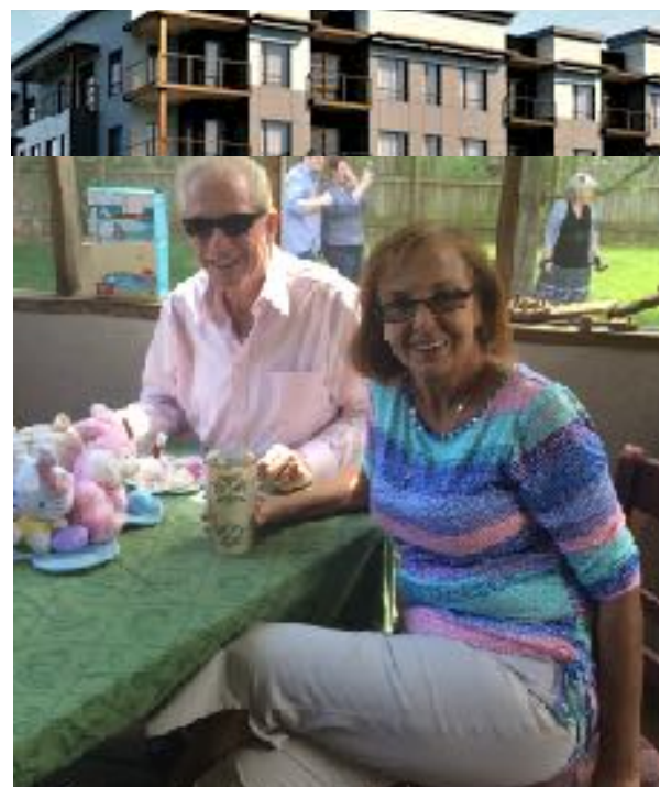
OUR SCREENED IN PORCH