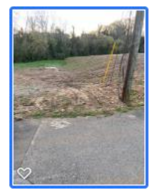
Pilkay St. corner of Cate Ave.