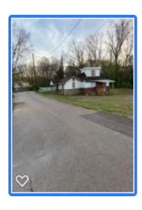
Abandoned house on Pilkay